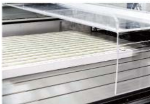
Strip stack infeed

Many features are available in order to finish the labels in accordance with any specification customers may require. It doesn't matter if most difficult shapes, or just square cut stacks have to be cut, punched and banded, the ATLAS-1110 ensures anytime the most reliable, efficient and accurate finishing process.