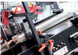
Separating & banding